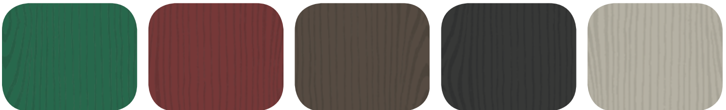
doors: forest green shutters: green